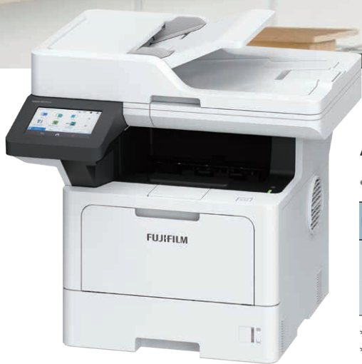
Apeos 4620 SZ