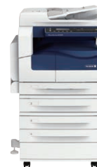
One Tray Module Two Tray Module

Note: Use FUJIFILM Business Innovation toner cartridges to ensure optimal performance and efficient recycling.