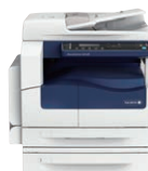
One Tray Module